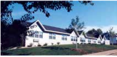
Parks Place Apartments 322 Depot Avenue Dixon, IL 61021