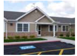
Sterling Apartments 2104 East 23rd St. Sterling, IL 61081

Supervised living environment in comfortable residential neighborhoods, with locations in Dixon, Mt. Carroll, Rochelle, and Sterling, Illinois.