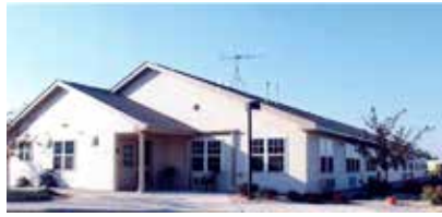
Sullivan Apartments 1126 Healthcare Drive Mt. Carroll, IL 61053