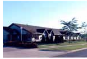
Fairview Apartments 555 Fairview Drive Rochelle, IL 61068