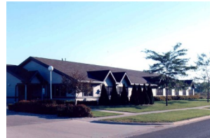
Fairview Apartments 555 Fairview Drive Rochelle, IL 61068