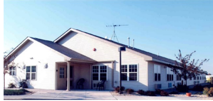
Sullivan Apartments 1126 Healthcare Drive Mt. Carroll, IL 61053