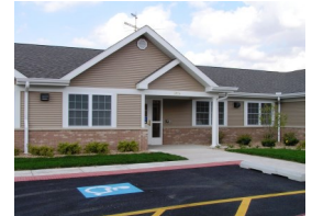
Sterling Apartments 2104 East 23rd St. Sterling, IL 61081

Supervised living environment in comfortable residential neighborhoods, with locations in Dixon, Mt. Carroll, Rochelle, and Sterling, Illinois.