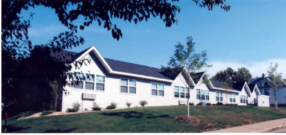
Parks Place Apartments 322 Depot Avenue Dixon, IL 61021