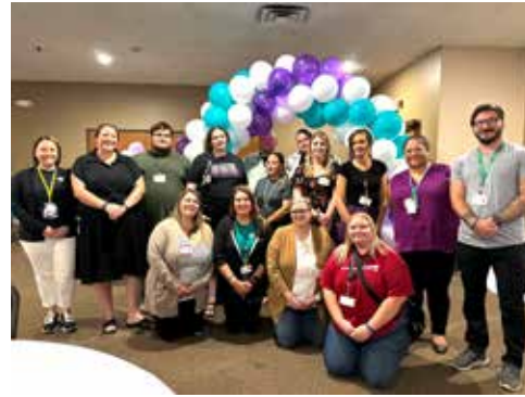
Sinnissippi management and staff that attended and who were on the event committee.

The 2024 event was well attended and featured a social hour, food, prize baskets, Art of Recovery activities, and concluded with a powerful peer panel discussion.