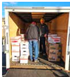
Boxes on their way to Sinnissippi offices, and then on to client families during the 2023 holiday season

It's the holiday season once again and that means it is time for Sinnissippi Centers' Holiday Food Basket Project. Each year participating Sinnissippi clinicians select some of their clients to receive a food basket just before Christmas. The food basket includes nonperishable fruits, vegetables, other sides, and a meat item. Costs have risen over the years and the average cost of a food basket is now around $30.00 to $35.00. If you would like to donate to the Holiday Food Basket Project, you can use the donation envelope in this mailing, mail your donation to Sinnissippi Centers, 325 Illinois Route 2, Dixon, IL 61021, or donated online at www.sinnissippi.org/donate . Donations are tax deductible.