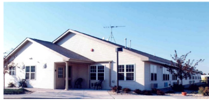
Sullivan Apartments 1126 Healthcare Drive Mt. Carroll, IL 61053