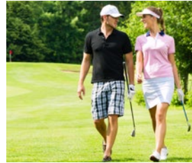
The Annual Golf Open takes place Thursday August 1, 2019 at Rock River Golf & Pool in Rocks Falls, IL

Rock River Golf and Pool Rock Falls, IL 12:30 p.m. tee off, dinner & awards follow immediately after golfing. Don't golf? Join us for the dinner.