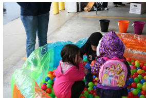
More families attend the celebration each year and there are always plenty of kids activities

smallest progress on that journey. Despite a chilly, rainy day, 150 individuals of all ages attended the annual Wellness & Recovery Celebration held in September 2012 and supported by the Sinnissippi Foundation. In 2013 the event will be held in August and feature a nationally known keynote speaker.