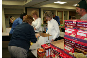
Volunteers help pack the 130 food baskets needed for the Thanksgiving holiday

It's amazing that the weight of all the food distributed in 2012 topped four tons! In comparison, the first year of the project distributed 72 baskets.